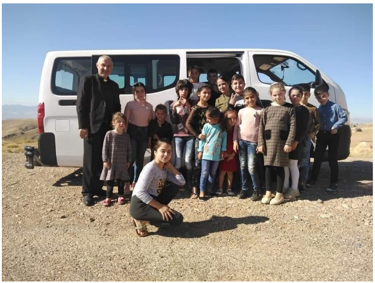
Opening up is an important issue for these isolated villages.

Reviving agriculture and local economy: thanks to the expertise developed in the Nineveh plain, we aim to support farms, small companies and businesses in this mountainous region