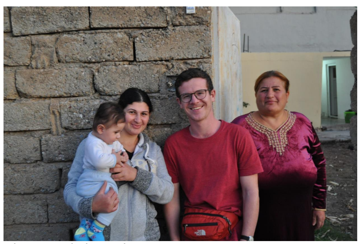
Volunteer visiting families in northern Iraq.

In northern Iraq, at the border with Turkey, a mountainous region lies where Christians have been living for centuries. They did not directly suffer the ISIS invasion in 2014 but rather generously welcomed their Christian and Yazidi neighbors from the Nineveh plains who had been kicked out from home by the jihadists. From now on, these Christians are now caught up in another conflict: Fights between the Turkish army and the PKK - an armed group advocating the independence of Kurdistan- have escalated in 2019. The area is frequently shelled and Christians, caught in the crossfire, fear to have to leave their villages. For several years, Fraternity in Iraq has been helping these remote inhabitants. In addition of regular visits to mountainous villages, provided support comprises supply of heating and other equipment, fitting of cisterns and refurbishment of buildings. In March 2019, the village of Sharanish was bombed again and Christians and Muslims who were living there had to flee. 24 families have steadily benefited from first need goods provided by the association throughout the year 2019.