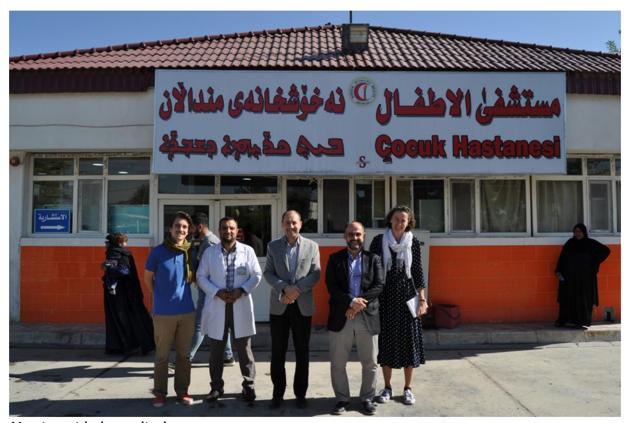
Meeting with the medical team.

In Kirkuk, Fraternity in Iraq is supporting the opening of a new therapy center for autistic youth. Construction is about to start: the team is dedicated, the therapy program set up meanwhile is a great success and the plot has been found! This center aimed to support autistic children is complementary to the assistance provided by Fraternity in Iraq to the nearby hospital, and is a sign of a sustainable and thorough support to the inhabitants of the area.