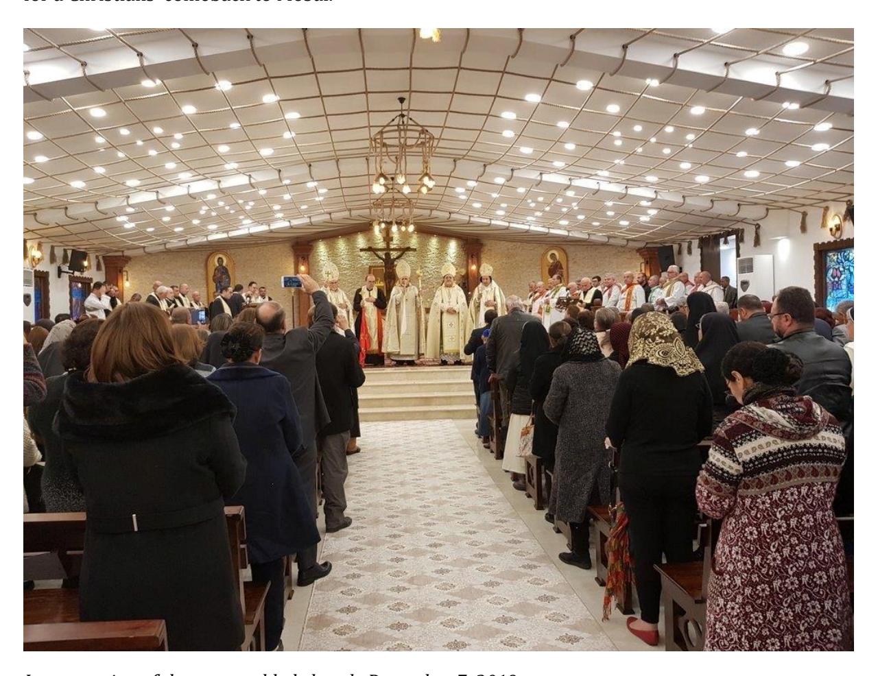
Inauguration of the reassembled church, December 7, 2019.

Late 2019, the structure of Al-Bichara Church in Mosul was reassembled, consolidated and fitted out thanks to the donors of Fraternity in Iraq! Besides, the Diocese of Mosul carried out the decoration phase. This is the ending of a great adventure for this church built in 2015 in the "Ashti" displaced people camp in Erbil: designed to be fully removable, it could be moved to Mosul to be reassembled at the place of origin of Al-Bichara Church. The latter had been wiped out beforehand because it was too damaged due to the fighting against Daesh. The inauguration of the new church on the 7th of December 2019 and the first mass celebrated there the next day symbolized the hope for a Christians' comeback to Mosul.