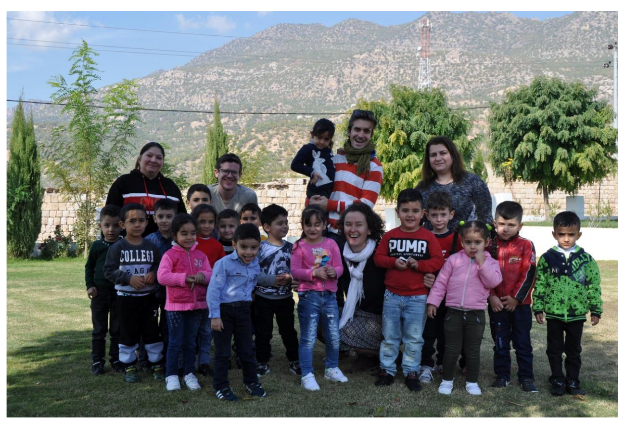
Volunteers regularly visit residents of remote villages in northern Iraq.